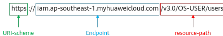
Figure 3-1 Example URI

https://iam.ap-southeast-1.myhuaweicloud.com/v3.0/OS-USER/users